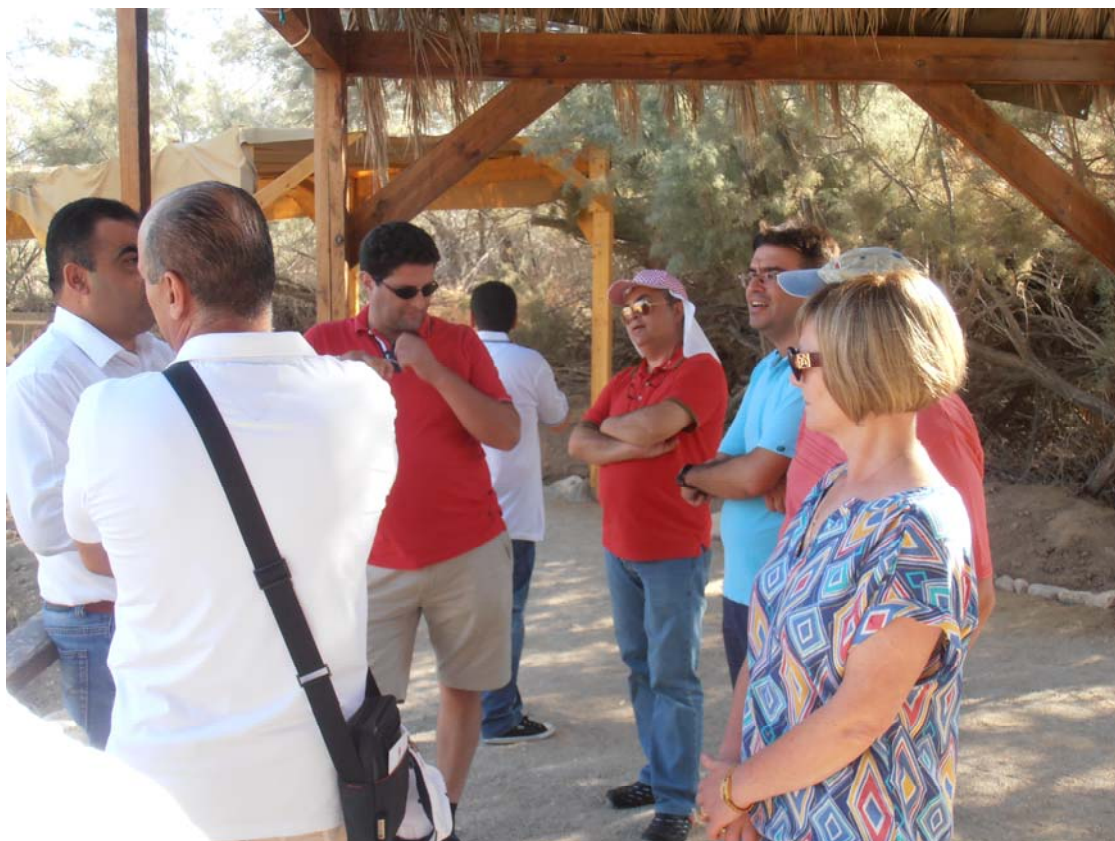
With our guide at the Baptismal Site on the River Jordan