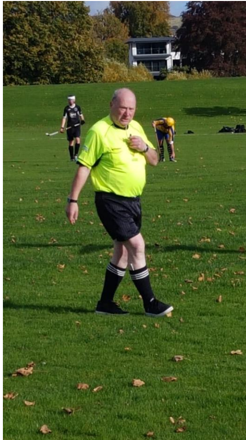
The Shinty Referee