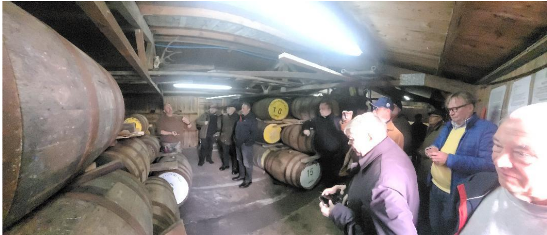
Finns at Red River distillery