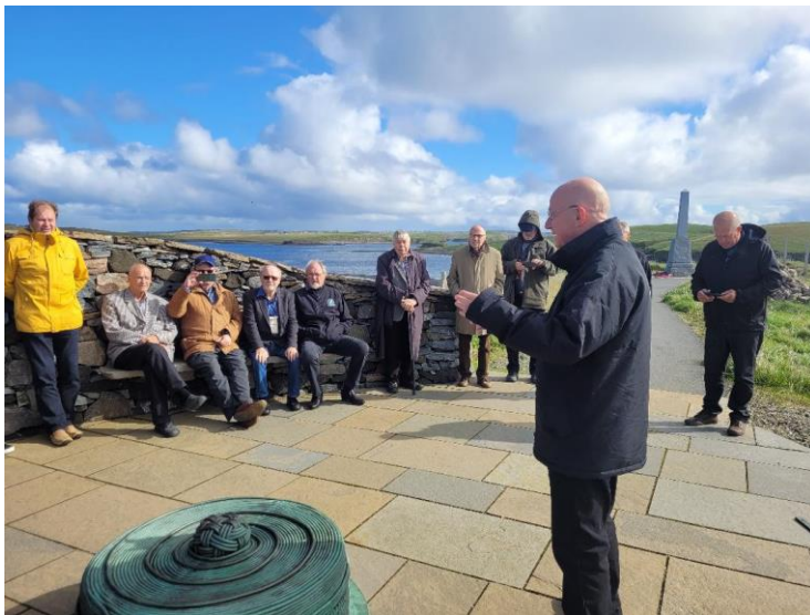
Finns at the Iolaire memorial

We had a visit from Finnish brethren in the middle of September, unfortunately we were unable to hold a meeting with them as it coincided with the mourning period for Queen Elizabeth 11. The Finns all belonged to “The Ballantynes Lodge Number Nothing” which is not affiliated to any Grand Lodge, but you must be a mason to belong to it, similar to the shed etc.