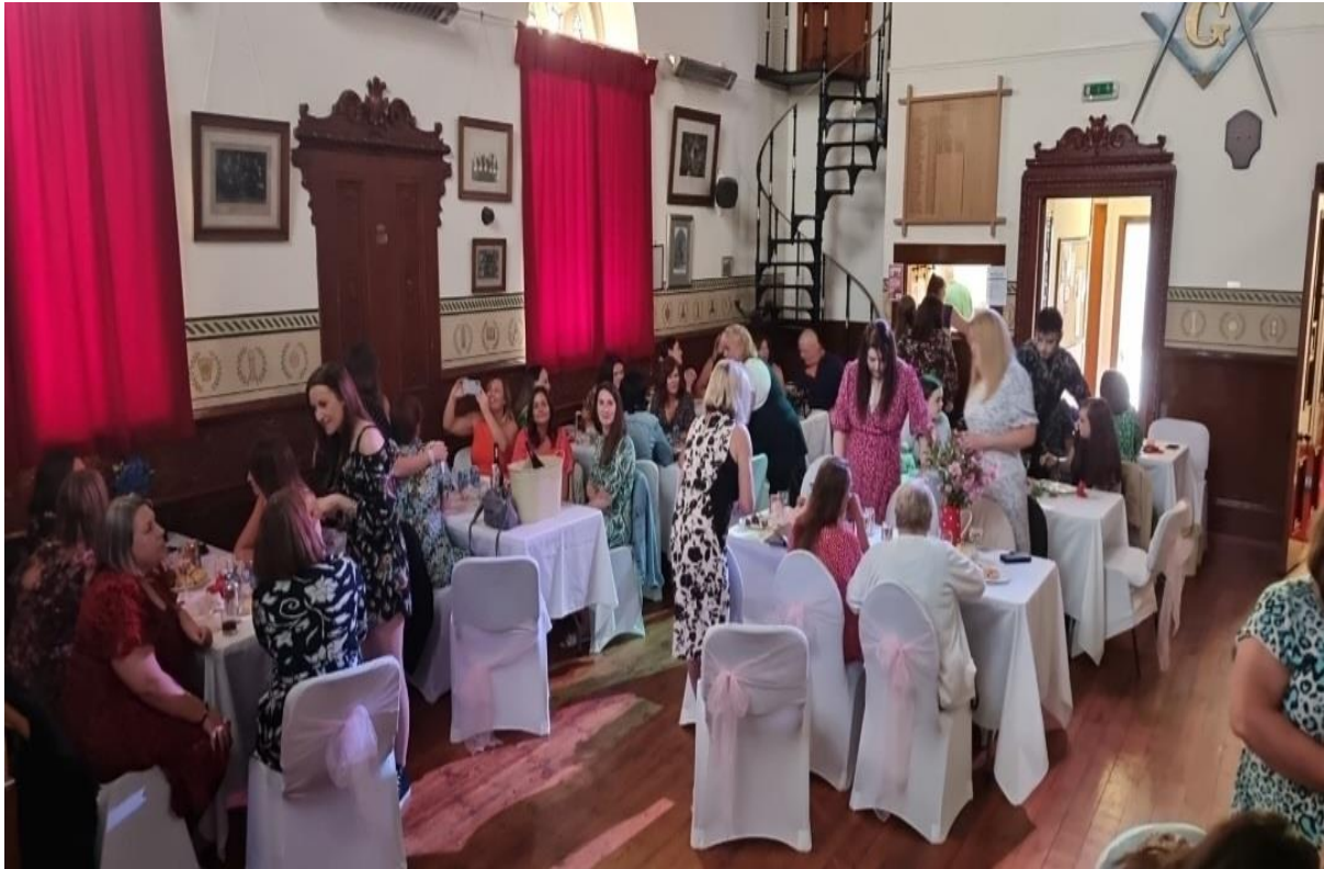
Time for tea