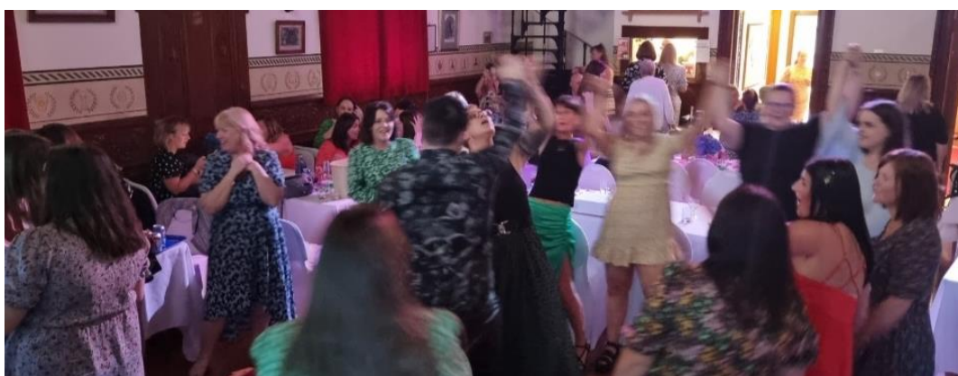
The rocking has started