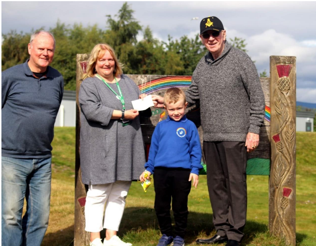
Donation from Lodge Ness No 888 to Park Primary School