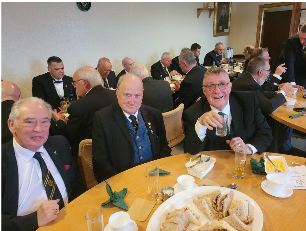
Fortrose Lodge members enjoying the harmony in Rosehaugh