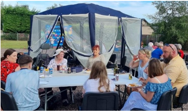
Enjoying the Barbie