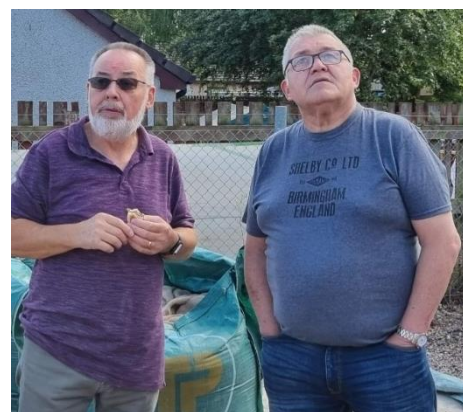
Is it a bird or a plane?