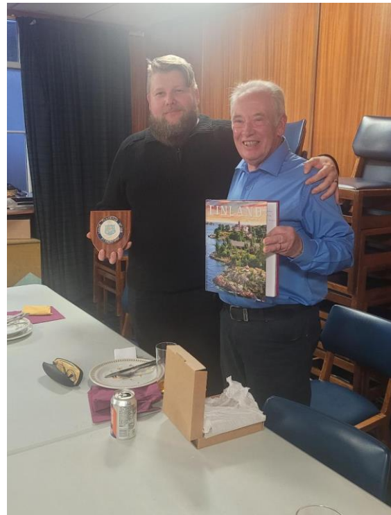
Reciprocating gifts with Finnish RWM