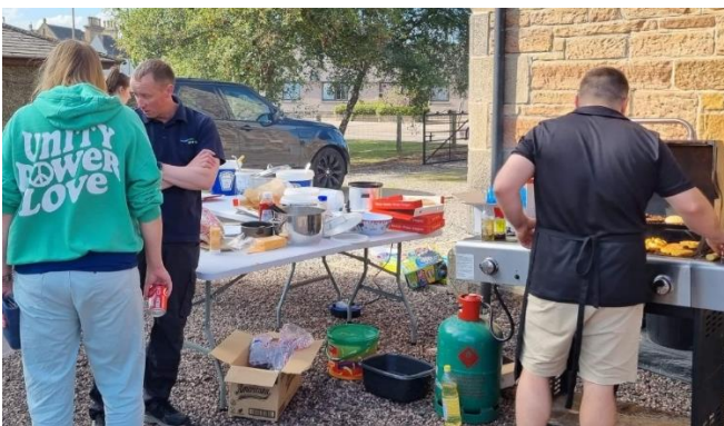
Chef on duty