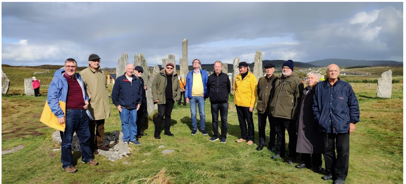
Finns at Callanish Stones