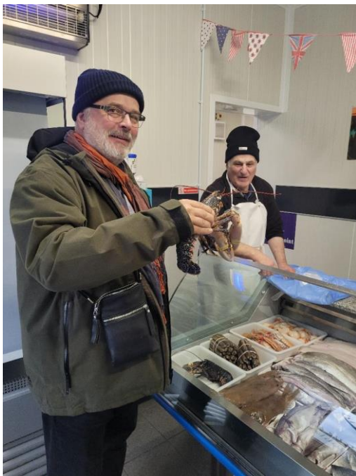
Finnish brother checking out the local seafood