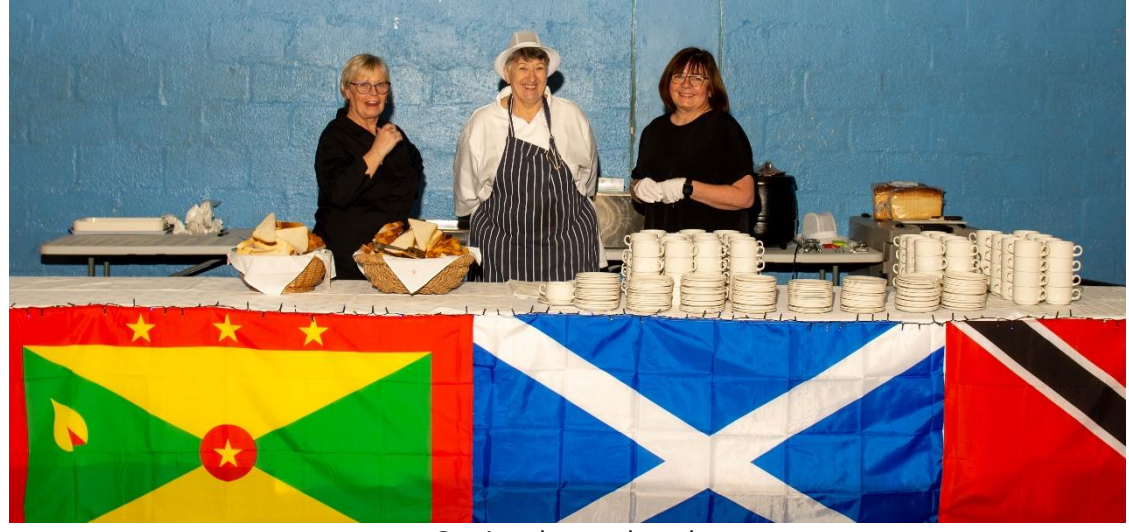
Getting the meal ready