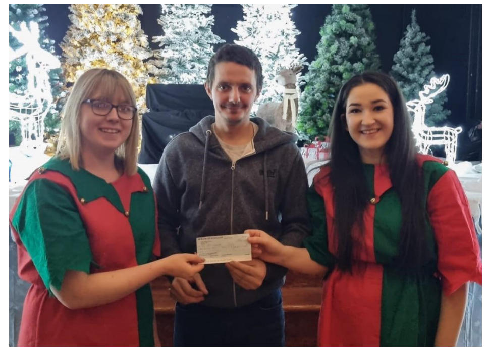
The "elfin" organisers receiving their cheque