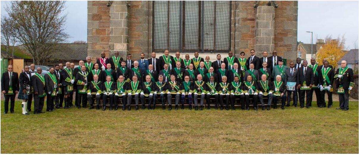
The Brethren who attended the Special Meeting in Lodge Averon