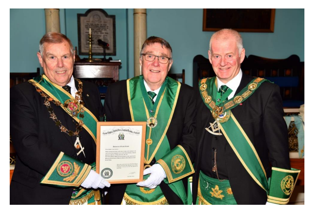
A very proud me being handed my honorary grand rank certificate and collar jewel.