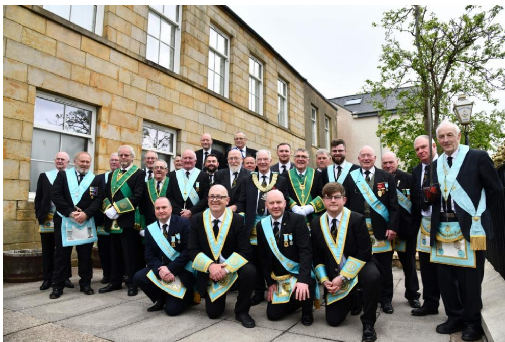
Fortrose Lodge brethren at 200 th anniversary of the Lodge building